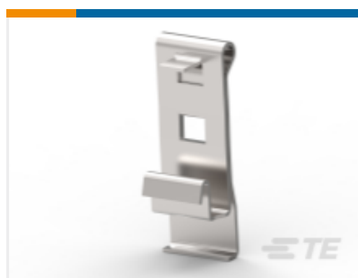
TE Part # 745255-2 SPRING LATCH 2/BAG